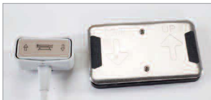
Choice of hand/footswitch operation