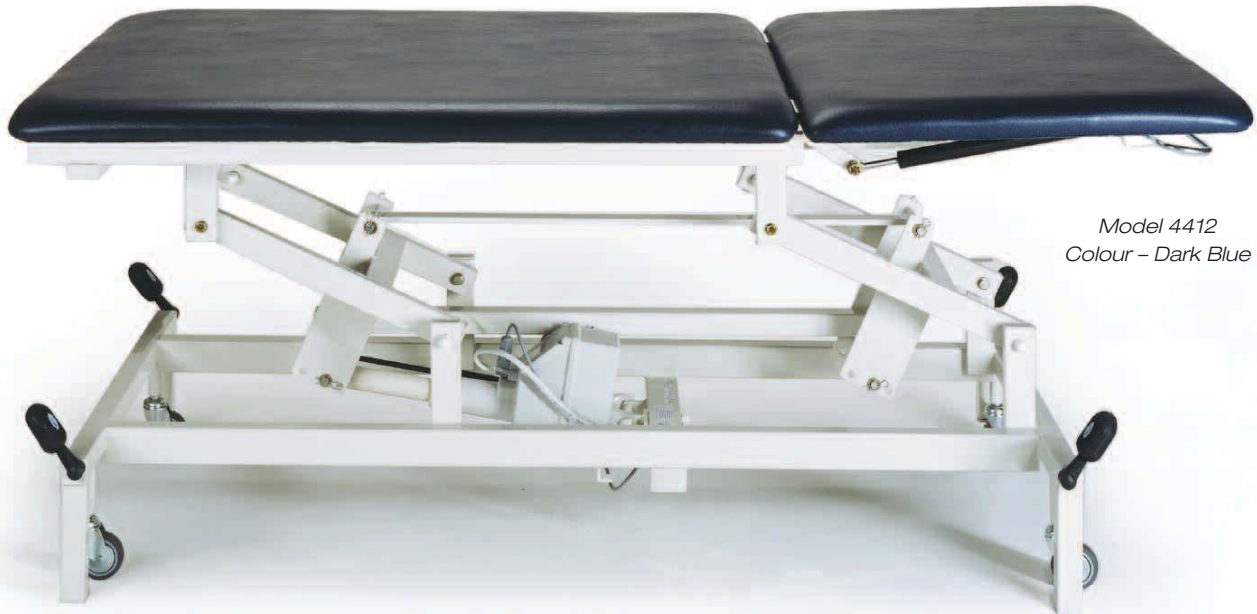
Model 4412 Colour – Dark Blue