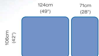
Model 4411 hydraulic Model 4412 electric