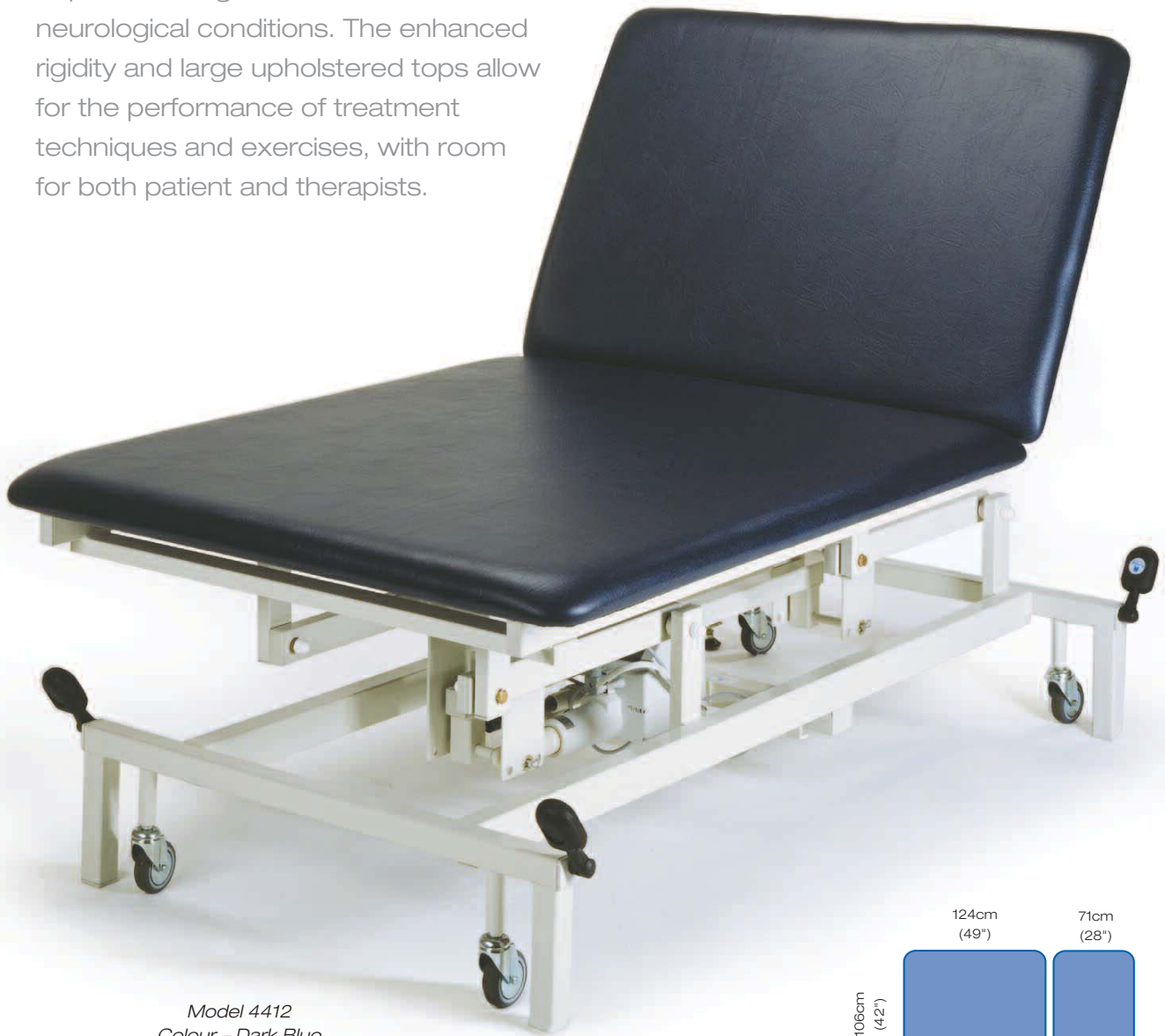
Model 4412 Colour - Dark Blue

The Akron Bobath range has been specifically designed for the rehabilitation of patients diagnosed with various neurological conditions. The enhanced rigidity and large upholstered tops allow for the performance of treatment techniques and exercises, with room for both patient and therapists.