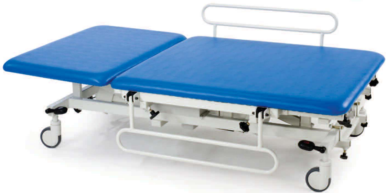
Model 4632 with optional side supports Colour - Bright Blue (non standard)

Both the table and specialised accessories were designed with the help and guidance of International Bobath tutors. This product sets the highest standards yet for the treatment and rehabilitation of patients with neurological conditions. The new frame design has an improved working and lifting capacity of 325Kgs, providing greater security and safety for both the on board therapist and the heaviest patient.