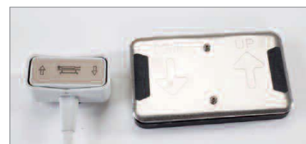
Optional hand or footswitch for electric model 2282A