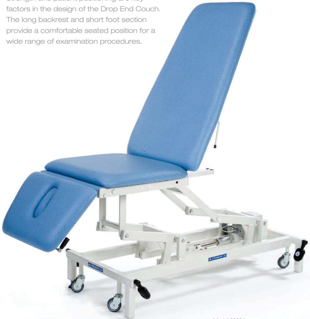
Model 2282A Colour - Turquoise

Strength and patient positioning are key factors in the design of the Drop End Couch. The long backrest and short foot section provide a comfortable seated position for a wide range of examination procedures.