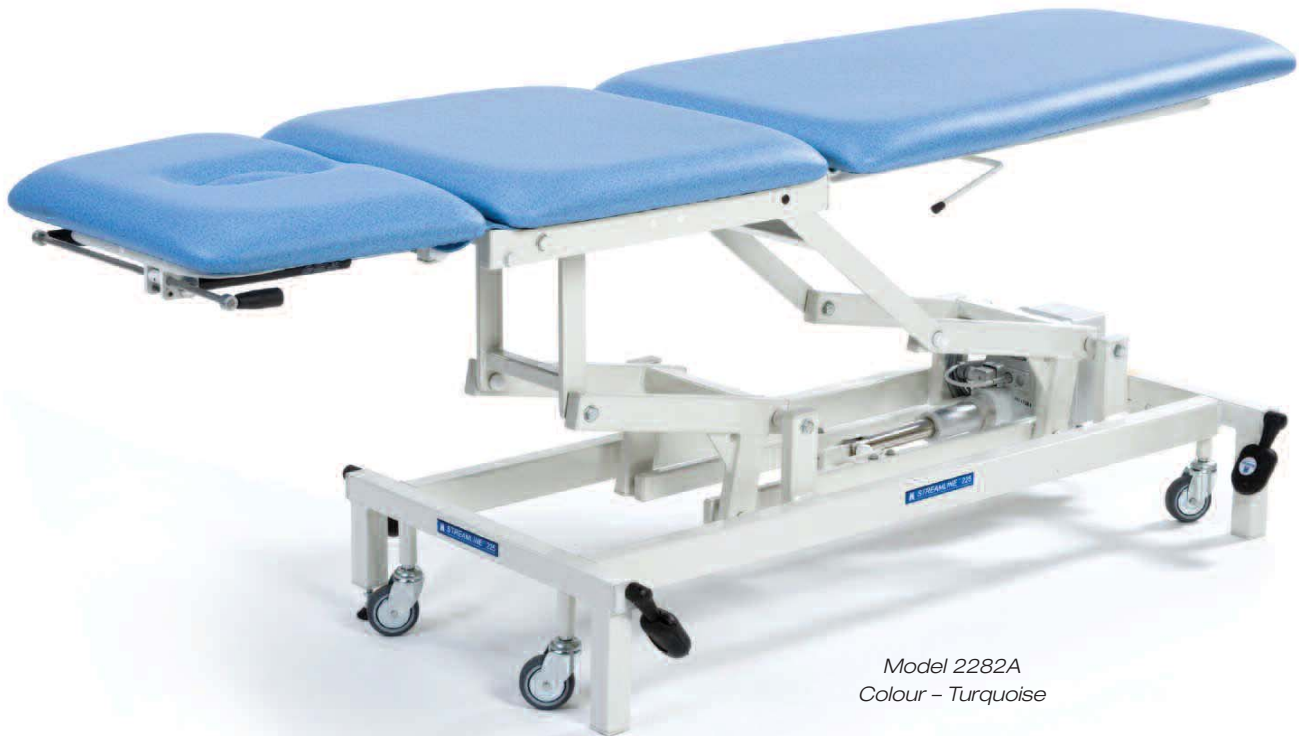
Model 2282A Colour - Turquoise