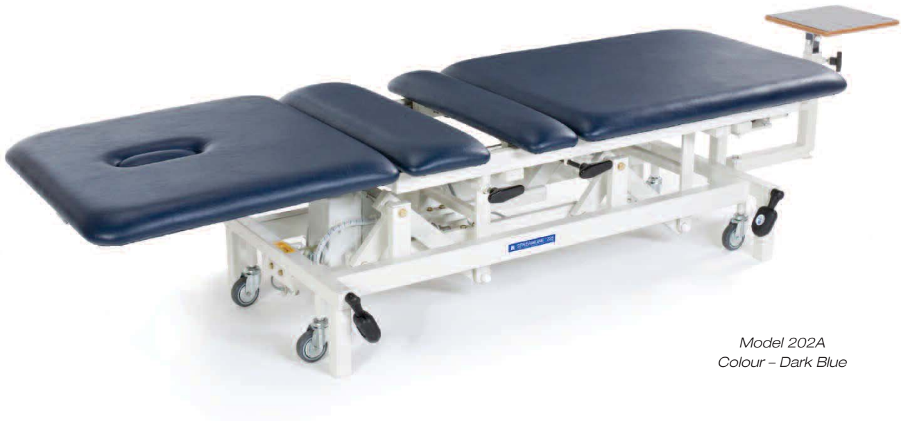
Model 202A Colour - Dark Blue