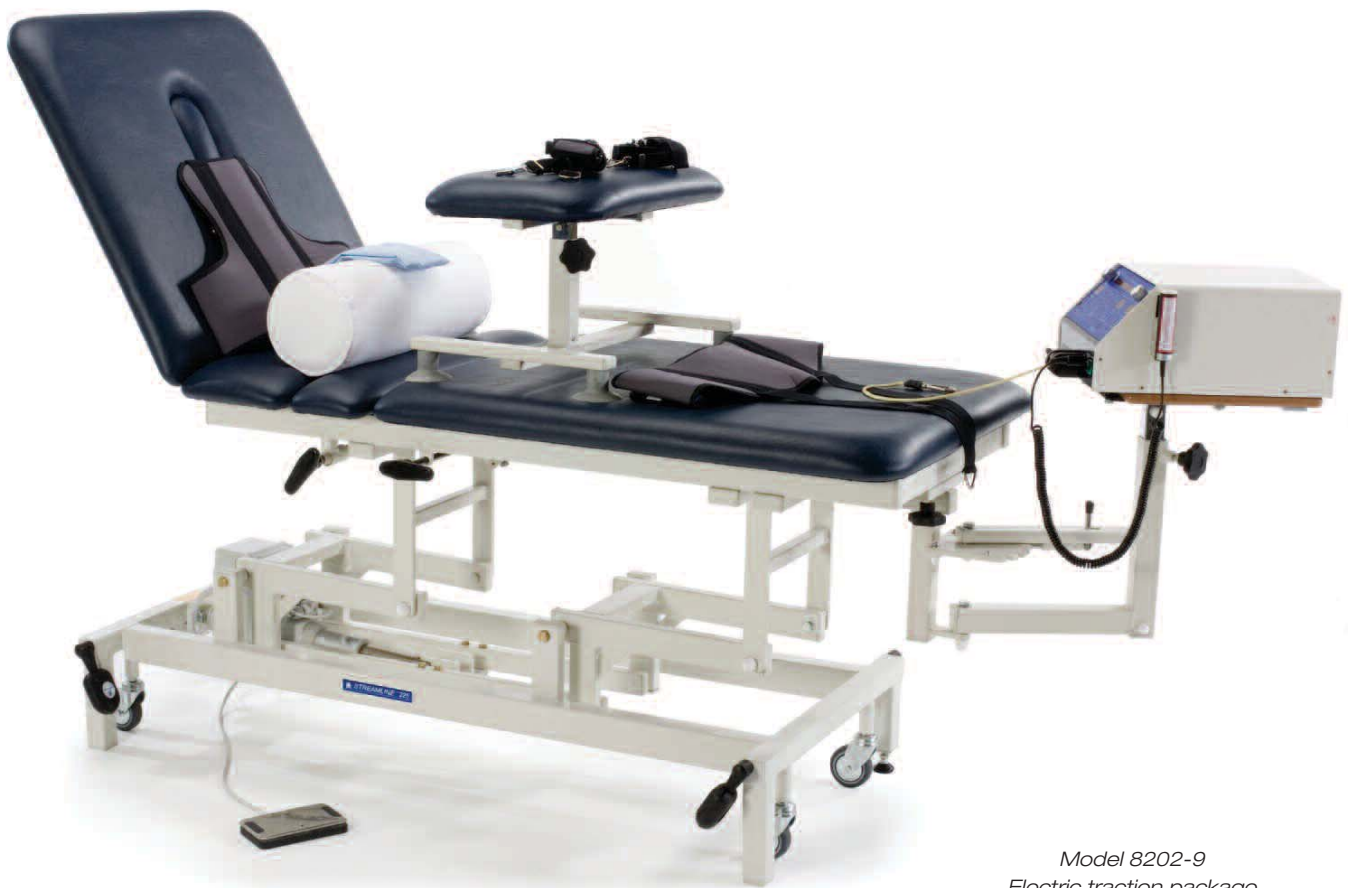
Model 8202-9 Electric traction package Colour - Dark Blue

The new design Streamline™ Traction Tables, with the increased safe working load are available separately or as part of a package with a full set of accessories. The new tables are fitted with a retractable wheel base and have mobile hoist clearance.