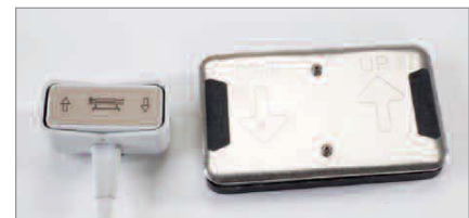
Choice of hand/footswitch operation